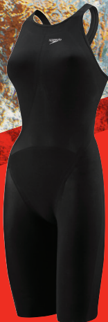
SPEEDO® + LZR RACER® ELITE RECORDBREAKER KNEESKIN