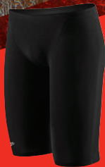
SPEEDO® + LZR RACER® ELITE JAMMER